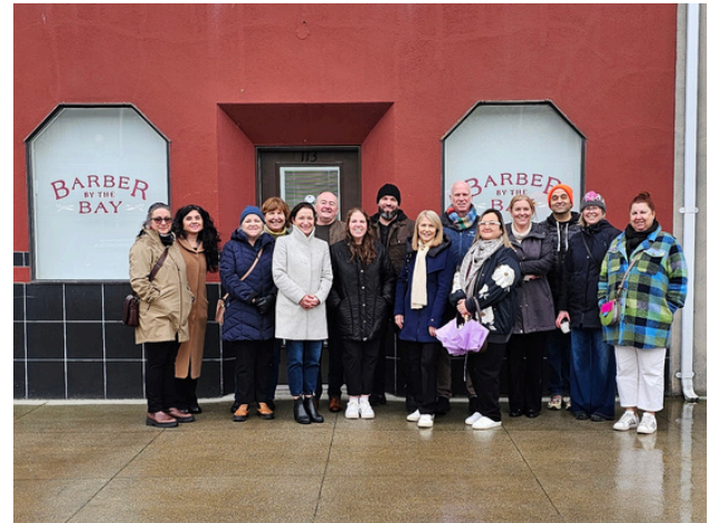
NV Chamber members explore behind the scenes at North Shore Studios during an exclusive tour!