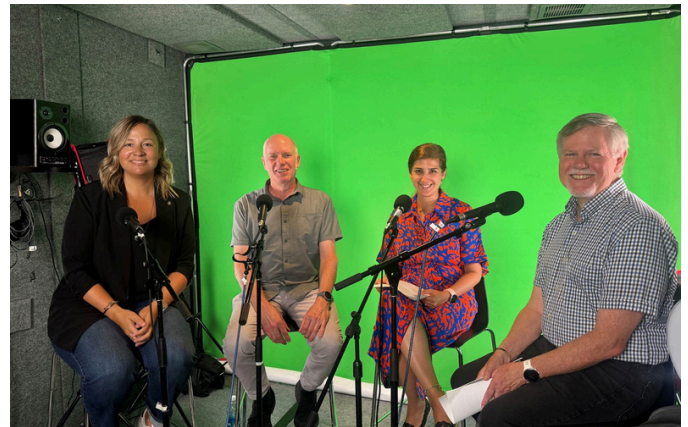
We were invited on the WorkBC Get A Job podcast to share how the North Van Chamber can be a powerful ally in your employment search. Listen now