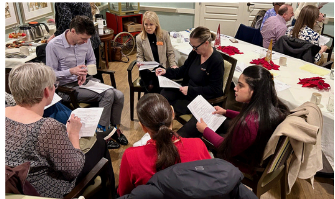
Our Senior Sector Roundtable, representing local businesses and non-profits, discusses challenges and opportunities involving senior care.