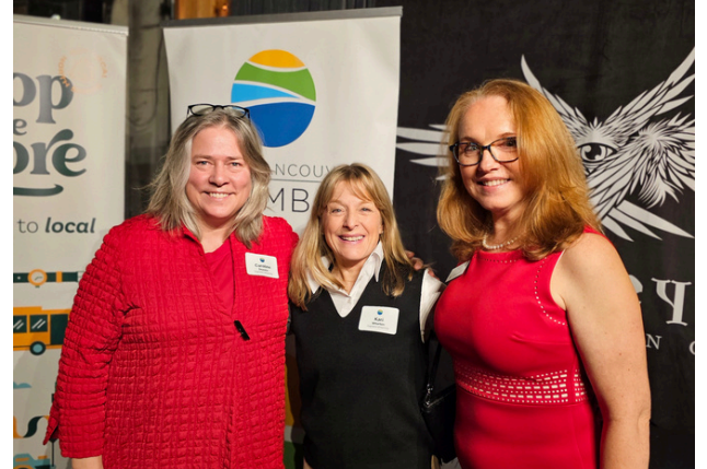
Toasting the season with CapU faculty & staff in December at Wildeye Brewing.