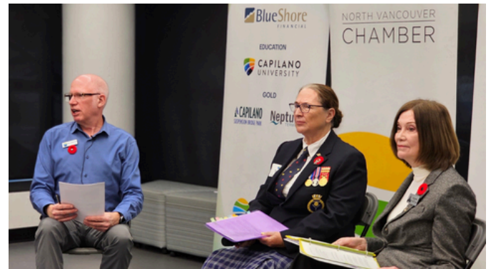
Our conversation and Q&A with North Van MLAs Susie Chant and Lynne Block tackled local issues.