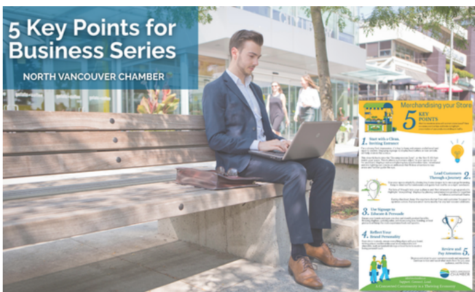
Our 5 Key Points for Business Series supports you with practical tips—from marketing to grant applications and regulatory compliance—to help your business thrive.