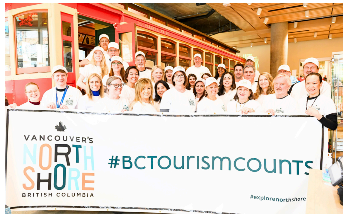
We are proud to support NVC Silver Annual Partner, Vancouver’s North Shore Tourism Association , in their work to promote local tourism opportunities.