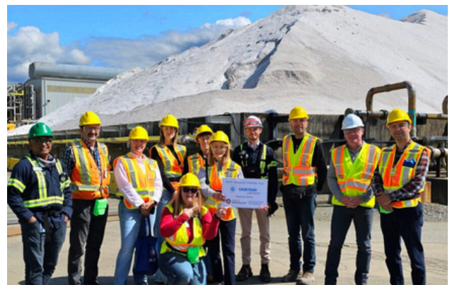
NV Chamber members on a tour of Chemtrade, one of North Vancouver's waterfront industrial manufacturers.