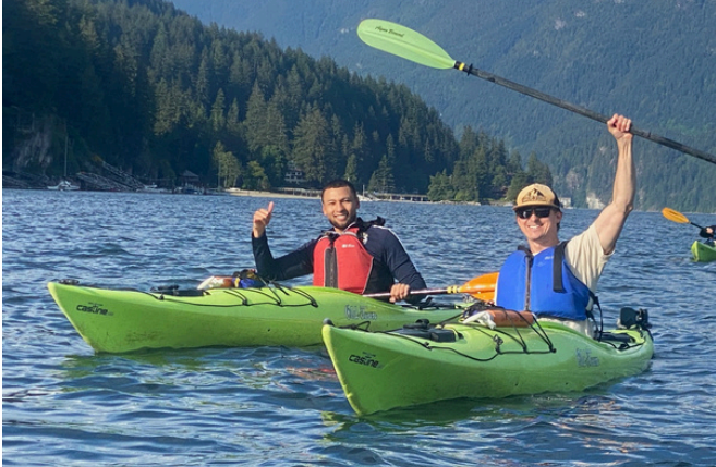
THIS is how we network in North Van! NVC members cruise on the water during a Business After 5 hosted by Deep Cove Kayak.