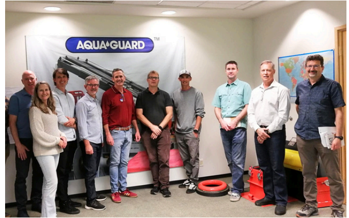
Our Marine Industry Roundtable members meet regularly to share opportunities, challenges, and innovations in the sector.