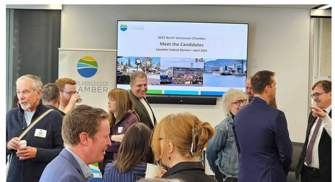
Meet the Candidates: Federal Pre-election Mixer put our members face-to-face with the candidates to ask questions relevant to their businesses.