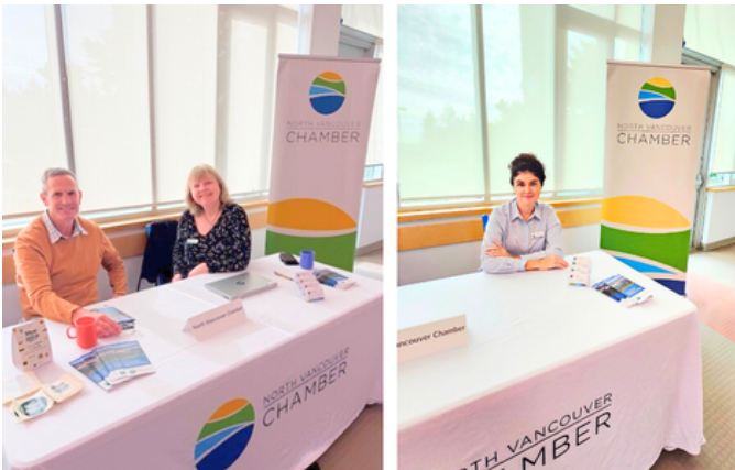
We partnered with Capilano University School of Business on a successful Business Career Fair and enjoyed connecting with the next generation of talent.