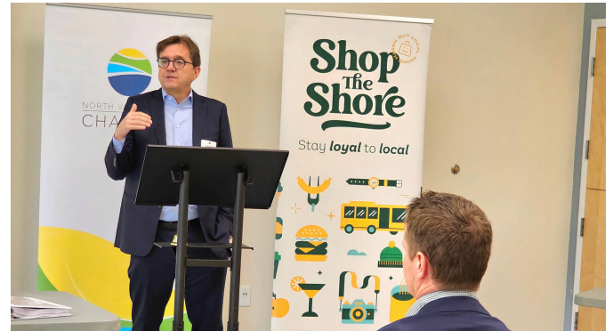
North Van MP Jonathan Wilkinson gave a federal budget overview to NV Chamber members.