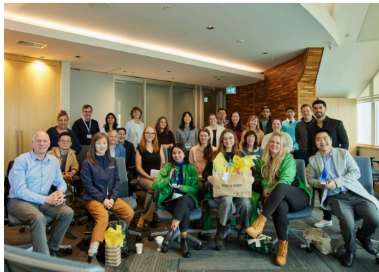
Capilano University's Work-Integrated Learning Awards Ceremony.