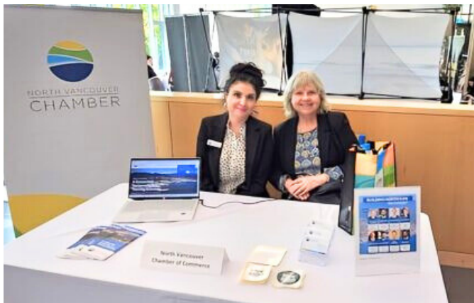
We partnered with Capilano University School of Business for a successful Business Career Fair.

Other collaborations include: District of North Van Economic Development Strategy , City of North Van Curb Access and Parking Plan , and North Shore Poverty Reduction Strategy .