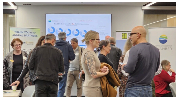
Meet the Candidates: Provincial Pre-election Mixer put our members face-to-face with the candidates to ask important questions.