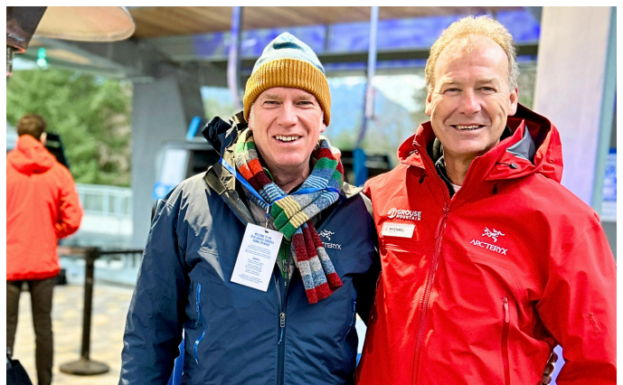
We attended the grand-opening celebration of the Blue Grouse Gondola at Grouse Mountain.