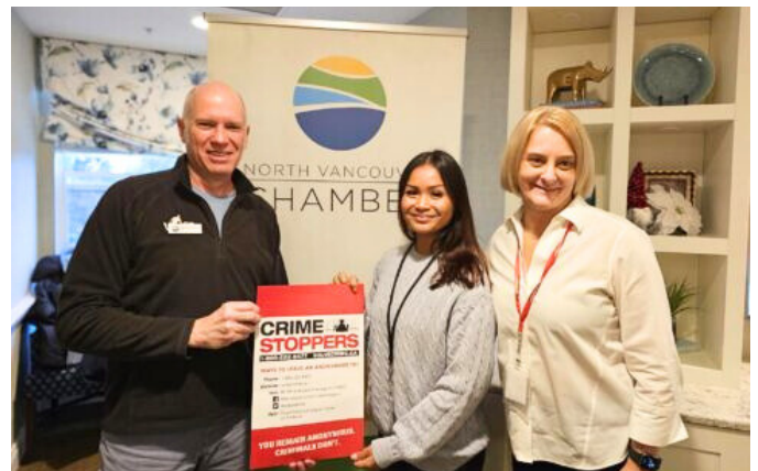
Sunrise Lynn Valley hosted our Networking and Presentation on Seniors Safety by Crime Stoppers.