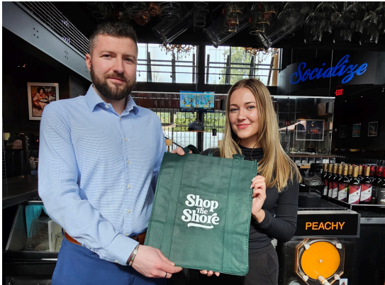
Browns Socialhouse Lynn Valley staff with their Shop the Shore swag!

Our ongoing initiatives support everyone—from students to small business owners—helping us build a stronger, more connected community together!