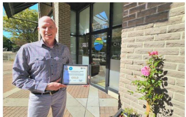
We received Gold certification from BC Green Business for integrating environmental and social actions into our operational strategy.