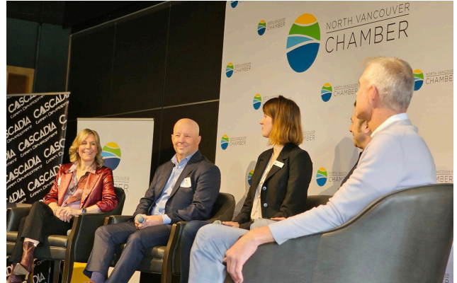
The State of Business 2025 featured a panel discussion and industry insights from NV Chamber members.