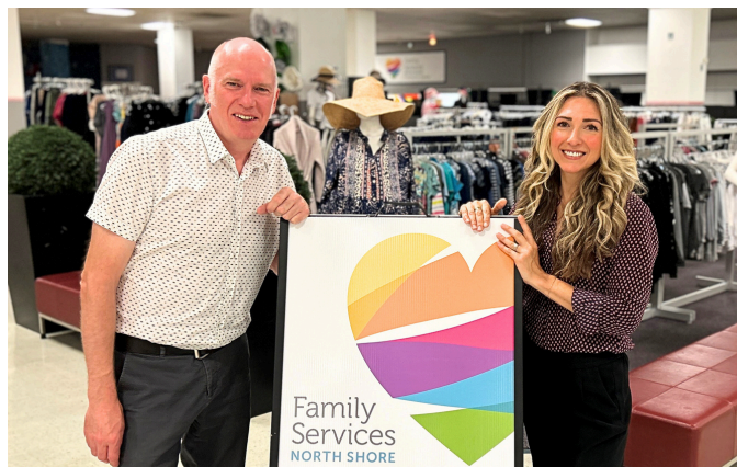
We visited Family Services North Shore Community Hub at Capilano Mall.