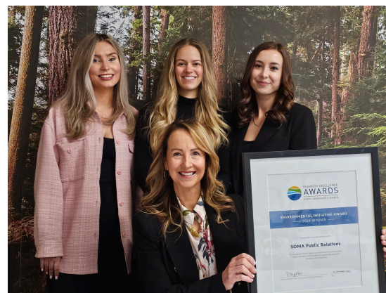
SOMA Public Relations was a 2024 BEA winner for Sustainable Initiative.

Our successful GrowthHub partnership connects NV Chamber members with Capilano University students, creating a win-win where students gain hands-on work experience and businesses receive valuable project support. #GrowthHub