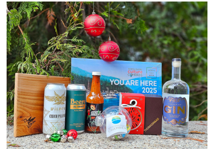
Shop the Shore Holiday Basket

We energized our Shop the Shore initiative, encouraging local-first spending through our NV Chamber in Your Neighbourhood series and a curated Holiday Basket spotlighting local makers. #ShopTheShore