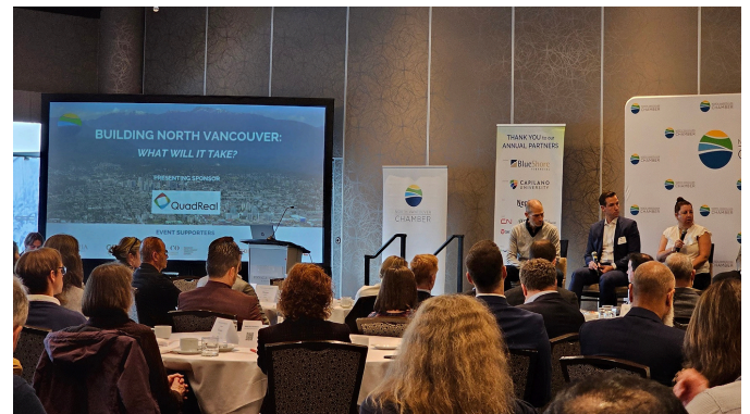
We led a vital housing dialogue, Building North Vancouver, for the community in October.